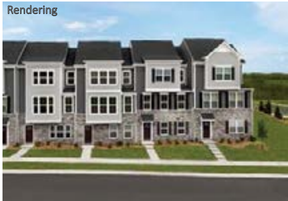
Village at Marketplace Townhomes by Heartland Homes

In addition, the township also boasts a number of regional and corporate offices, many of which are located along I-376 in various business parks. The new master plan Village at Marketplace is now under construction and will add hundred of residents. The overall Marketplace community will include senior housing, market rate apartments and townhomes, and Class A office buildings with exceptional amenities.